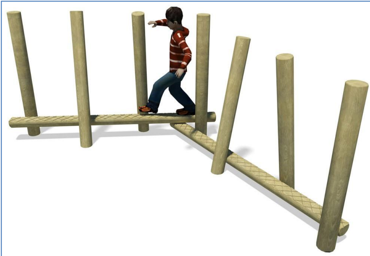
Bal # 3