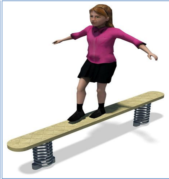
Bal # 2