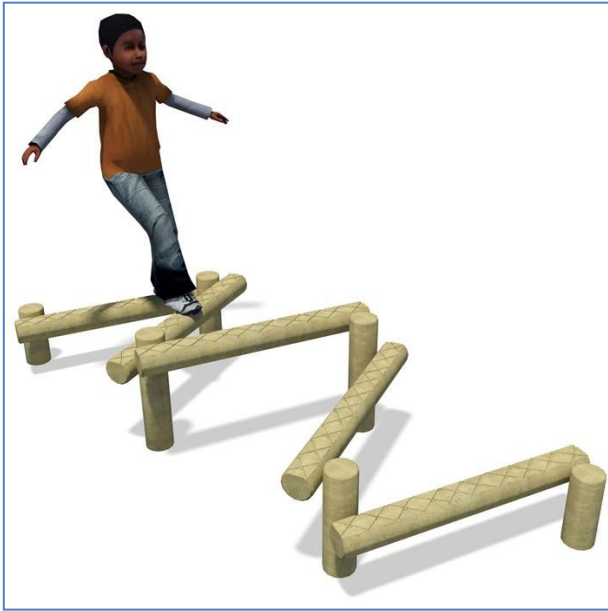
Bal # 1