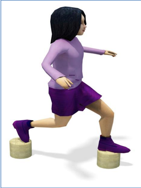
Bal # 6